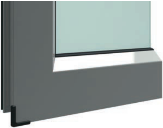
Commercial grade aluminium corner stake assembly

The Carinya Classic Awning Window has been designed with matching stylish hardware, with the option for a lockable or non-lockable handle.