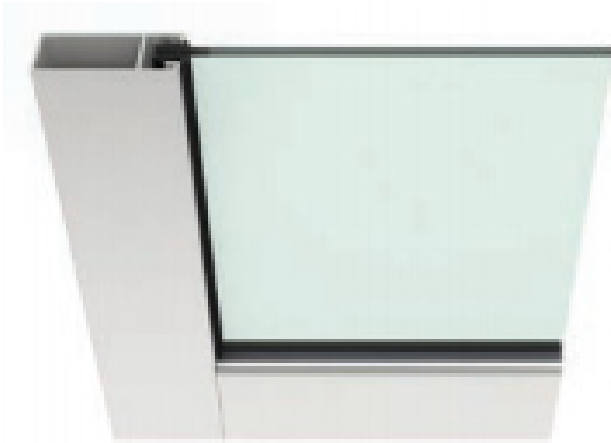
58mm wide rails and stile.

The Carinya Classic High Performance Sliding Window has been matched with commercially designed hardware to ensure style and durability in the harshest of environments.