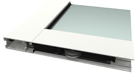
Commercial grade rollers up to 160kg

Both roller systems have been designed to interact with the stiles to create a strong and robust panel, minimising movement in joints and opportunities for air infiltration.