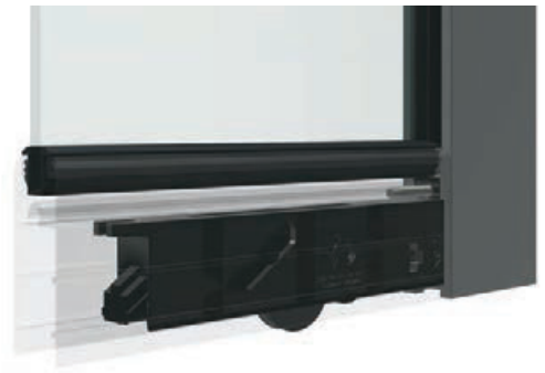
Carinya's high performance, commercial door roller used in the Carinya residential sliding door for smooth operation.

Both roller options have been designed to integrate with the stiles to create a strong and robust panel, minimising movement in joints and opportunities for air infiltration.