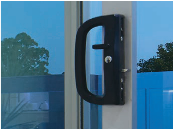
Functional and stylish Dual Point Yarra Curve door lock. Yarra Edge door lock with optional stylish colours also available

The Carinya Classic Sliding Door has been matched with commercially designed hardware to ensure style and durability.