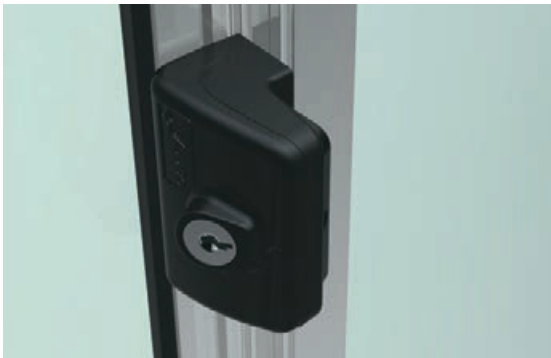
Exclusive proprietary handle for ease of operation with optional colour finishes.

The Carinya Classic Sliding Window has been designed with matching stylish hardware, with the option for a lockable or non-lockable proprietary handle.