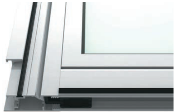
Stainless housing commercial grade rollers for all glass options

An optional vent lock is also available allowing the sliding sash to be secured in a semi-opened position for increased safety.