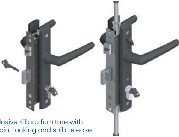
Exclusive Killara furniture with 4 point locking and snib release

The Carinya Select Bi-Fold Door has been internally designed to blend with the hardware. All locks and flush bolts blend seamlessly with the custom extrusion for a professional finish.