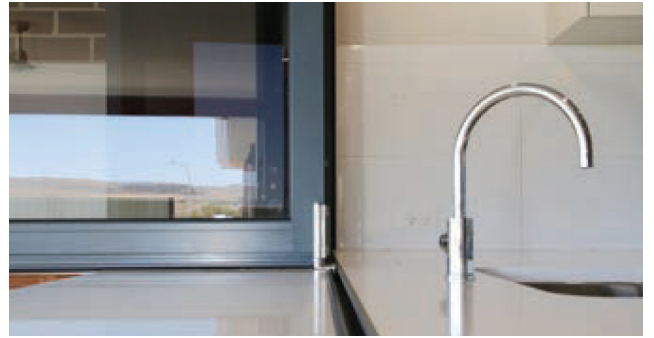
Flush Bi-Fold window sill for smooth transition in kitchen servery application.

Killara Xtra Furniture allows for an internal snib option with lock indicator and two or four point locking for all configurations.