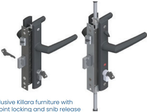
Exclusive Killara furniture with 4 point locking and snib release

The Carinya Select Hinged Door has been designed with hardware from the start, not as an after thought. All locks and flush bolts blend seamlessly with the custom extrusion for a professional finish.