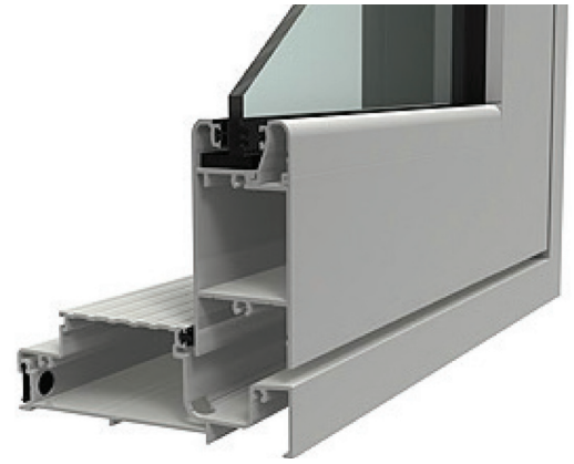
Carinya 125mm Hinged Door Sill Detail

Killara Xtra Furniture allows for an internal snib option with lock indicator and two or four point locking for all configurations.