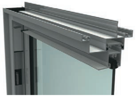
Easy take out clips on side jambs for removal of sash.

This design also means that both top and bottom sashes can be easily removed to allow easy cleaning of the window from inside the house.